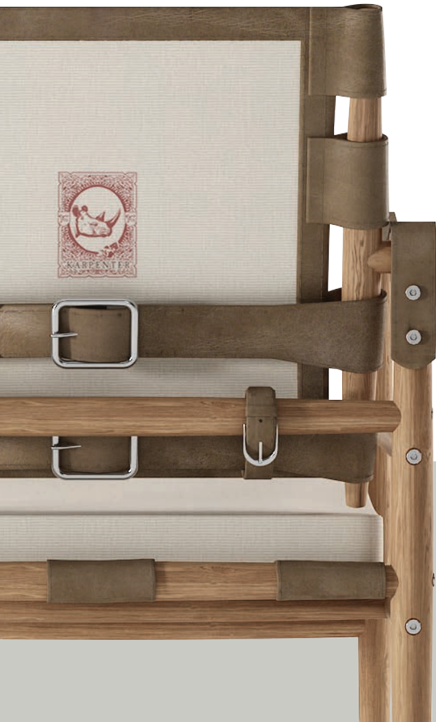
EASY CH AIR 61 X 63.5 X 76 CM